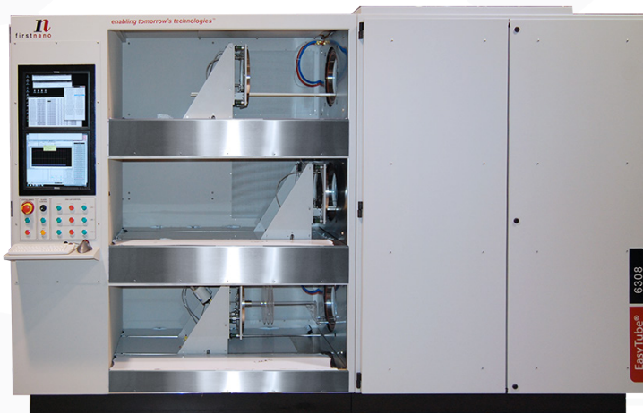
EasyTube® 6308 Three Tube Furnace System

Batch processing of multiple wafers in separately configured reactors all-in-one